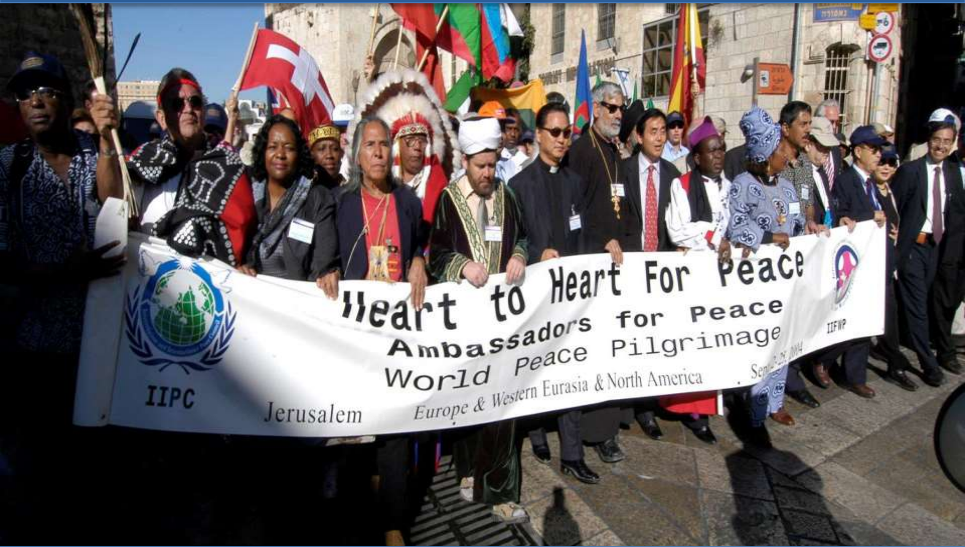
Middle East Peace Initiative "Peace March" in Israel