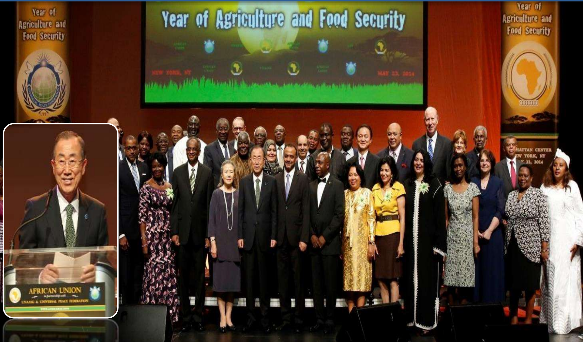
Annual Africa Day Celebration in New York City