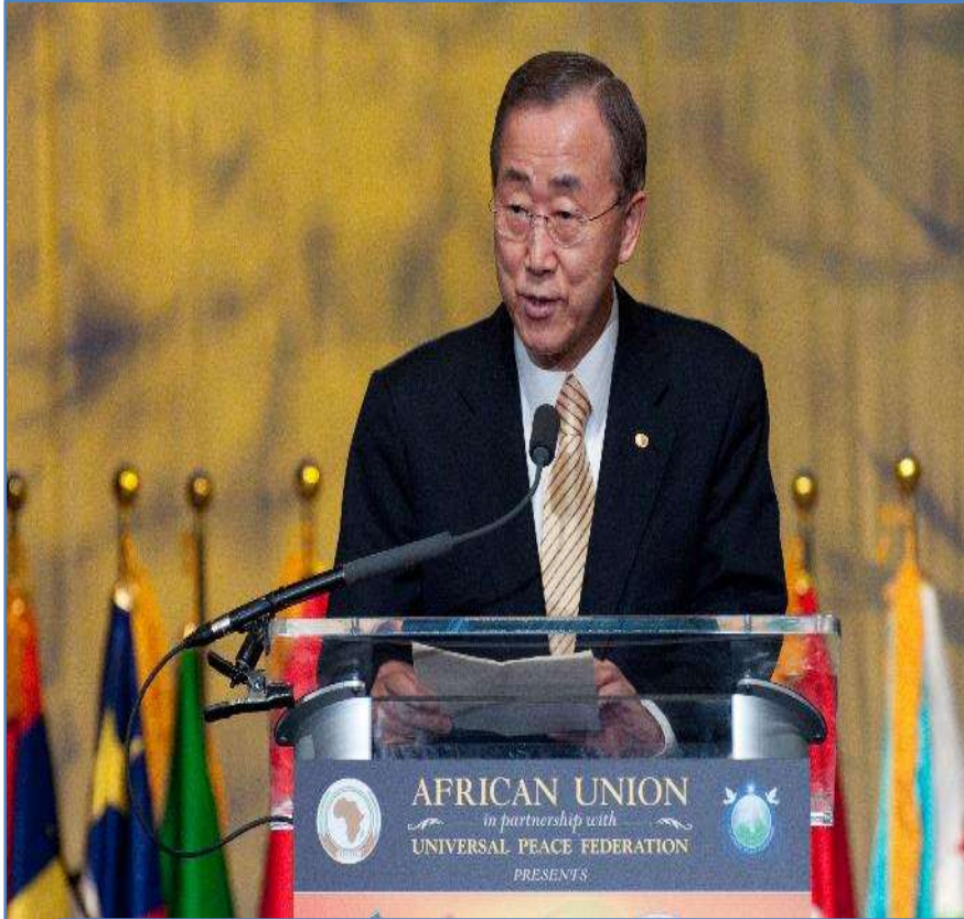
Secretary General Ban Ki-moon Africa Day 2010, NYC