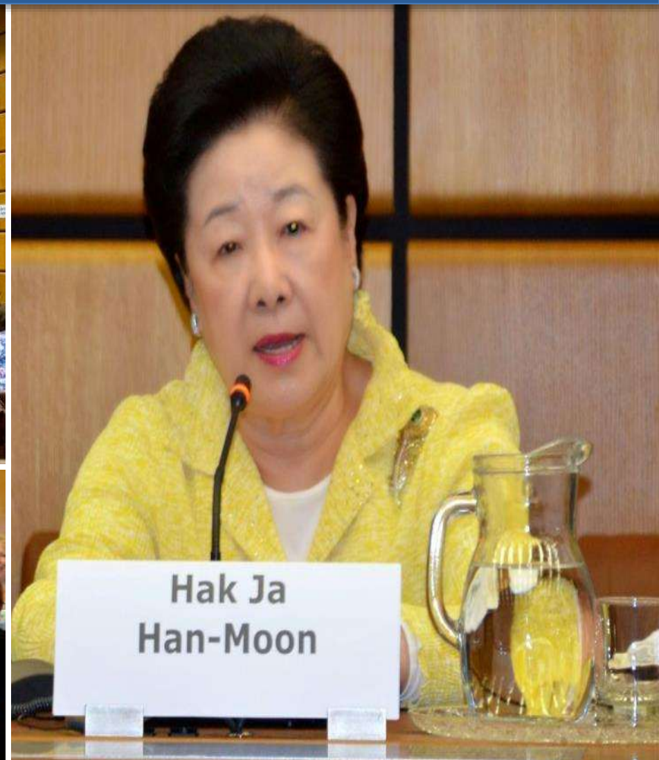
Vienna – Dr. Hak Ja Han Moon, Founder, UPF International