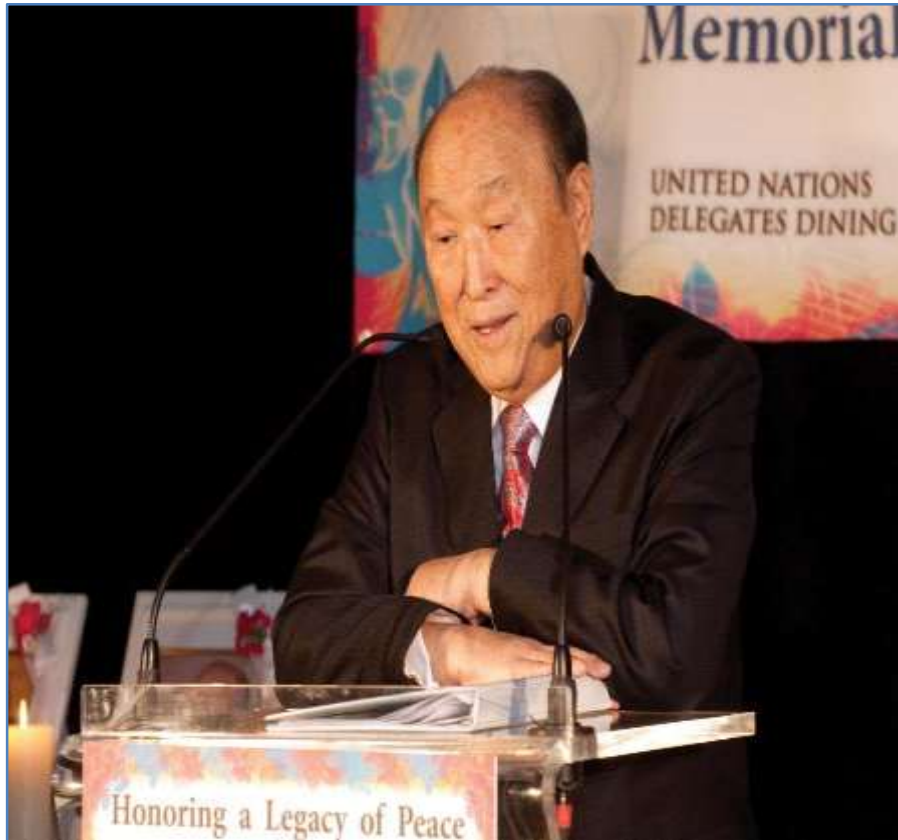
Honoring a Legacy of Peace United Nations, March 2010