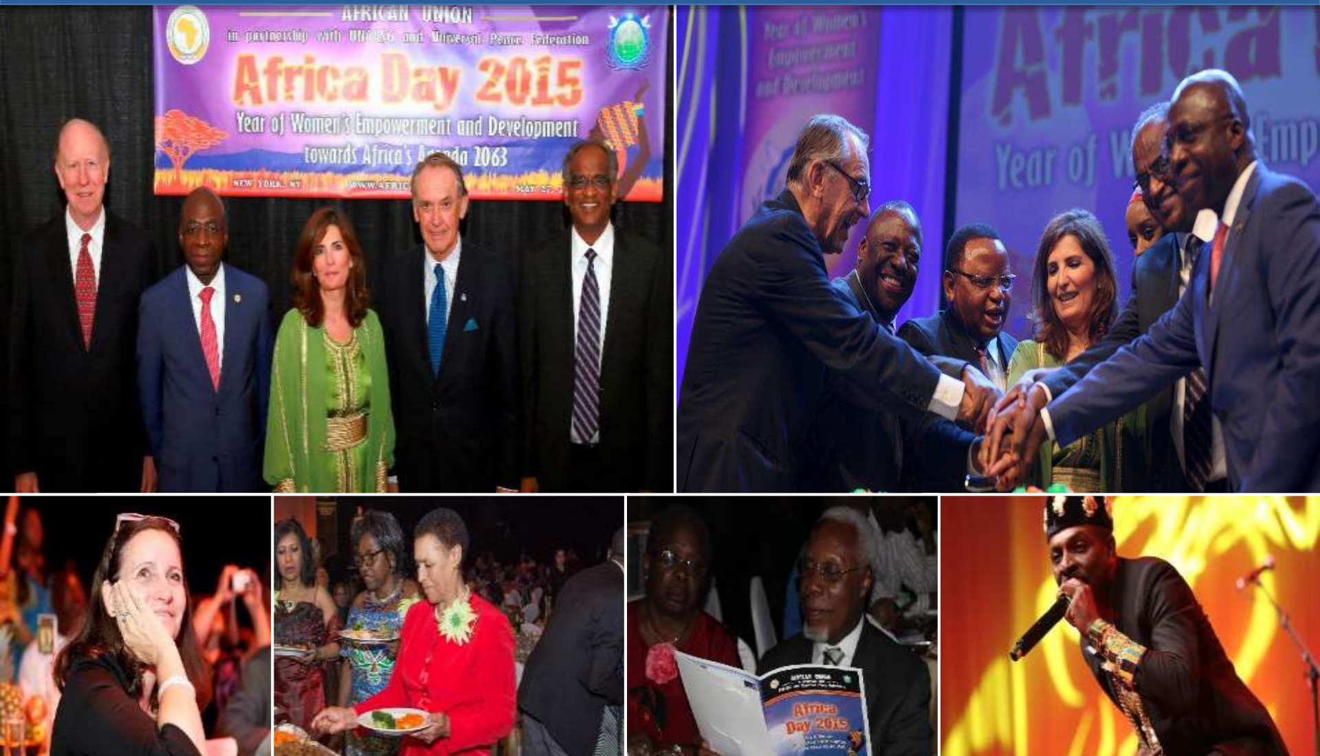
Annual Africa Day Celebration in New York City