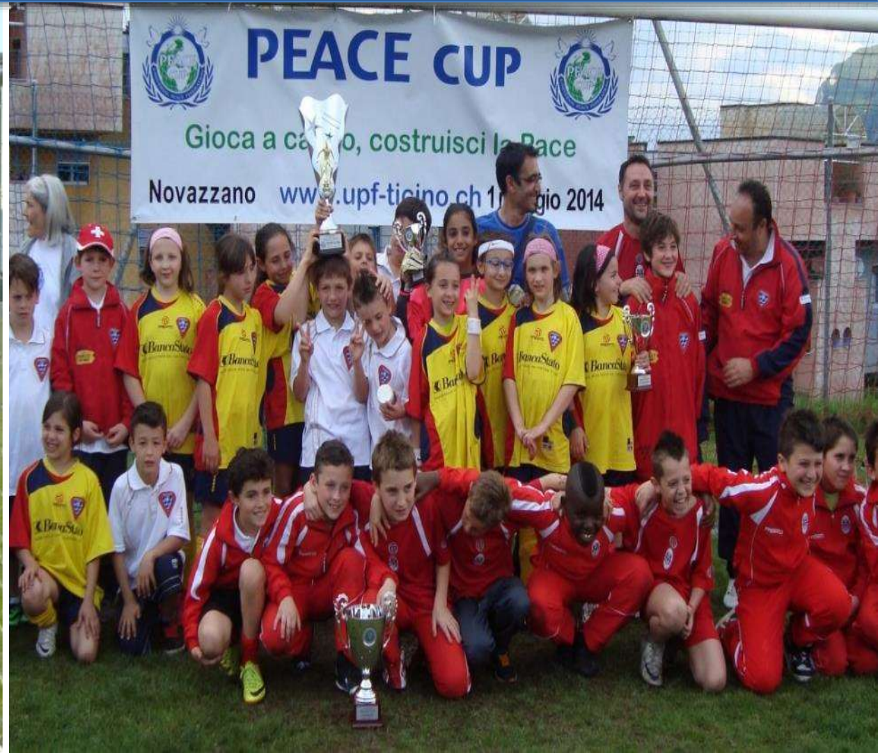
Children's Peace Cup: Switzerland