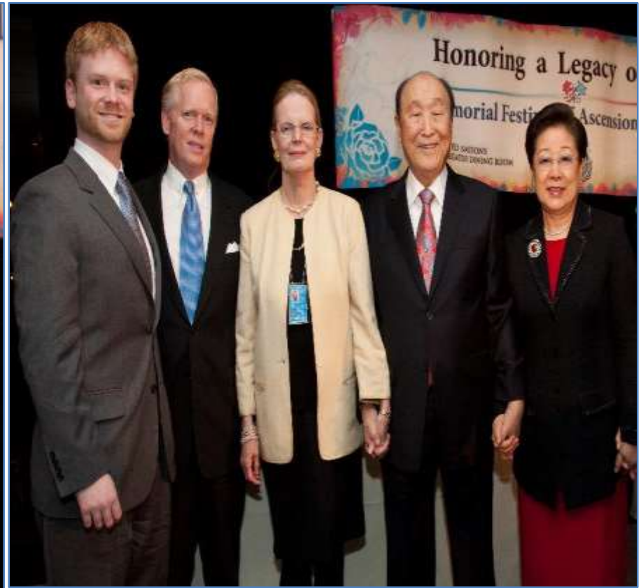
Honoring a Legacy of Peace United Nations, March 2010