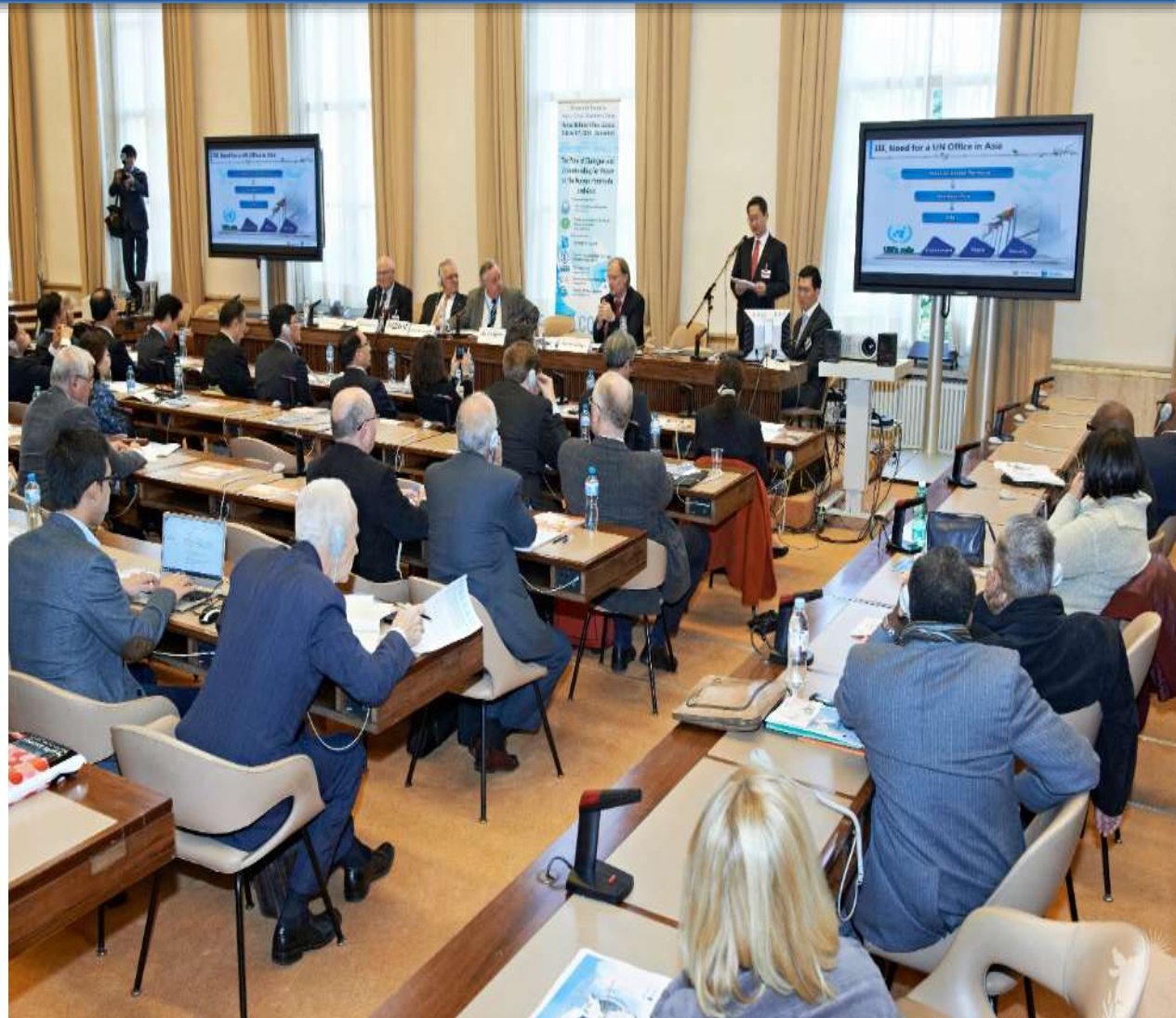
Forum on De-escalation on the Korean Peninsula: UN in Geneva