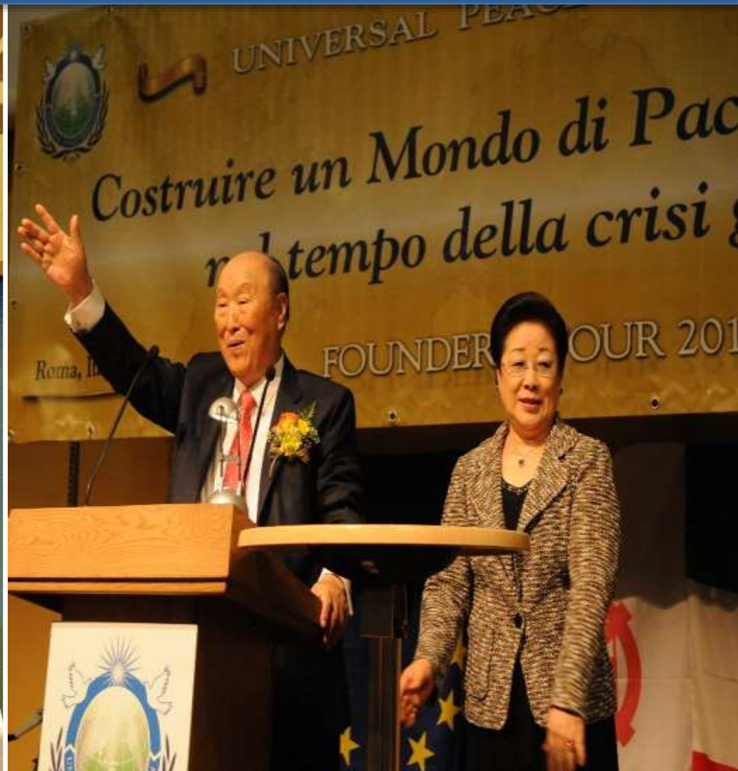
Geneva and Rome – Dr. Hak Ja Han Moon, Founder, UPF International (2011)