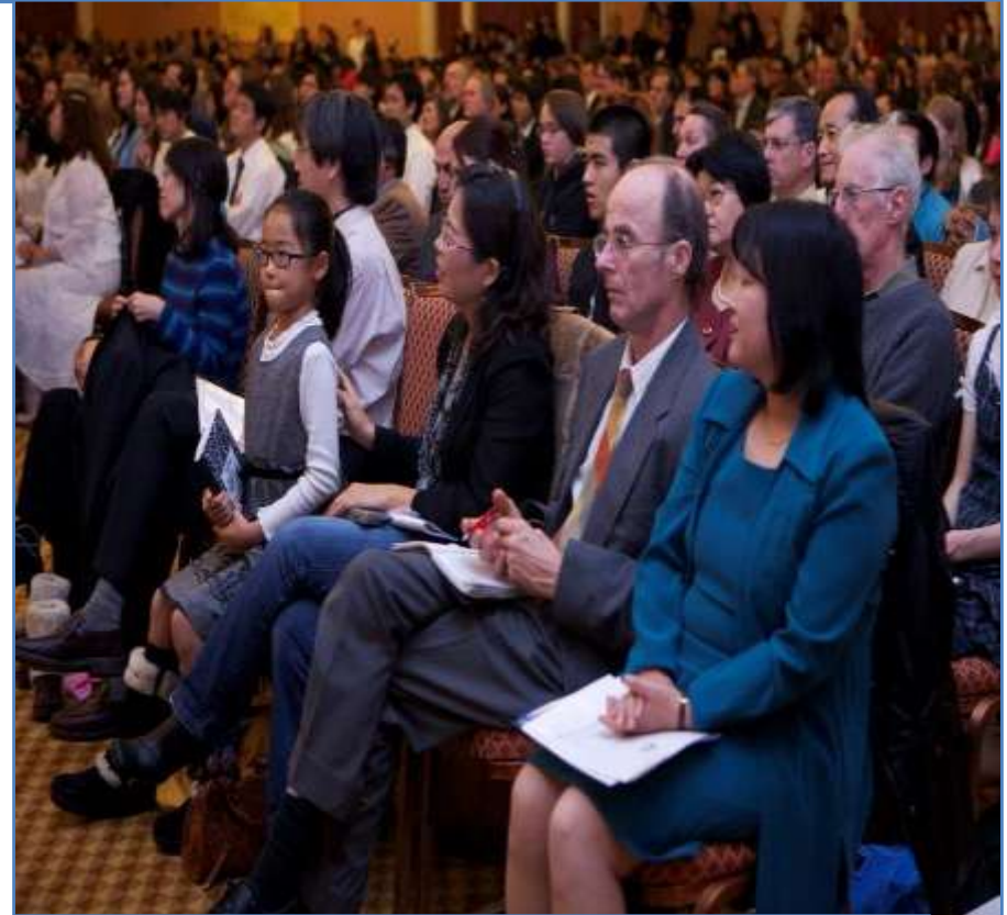
World Assembly in NY and NV November 2010