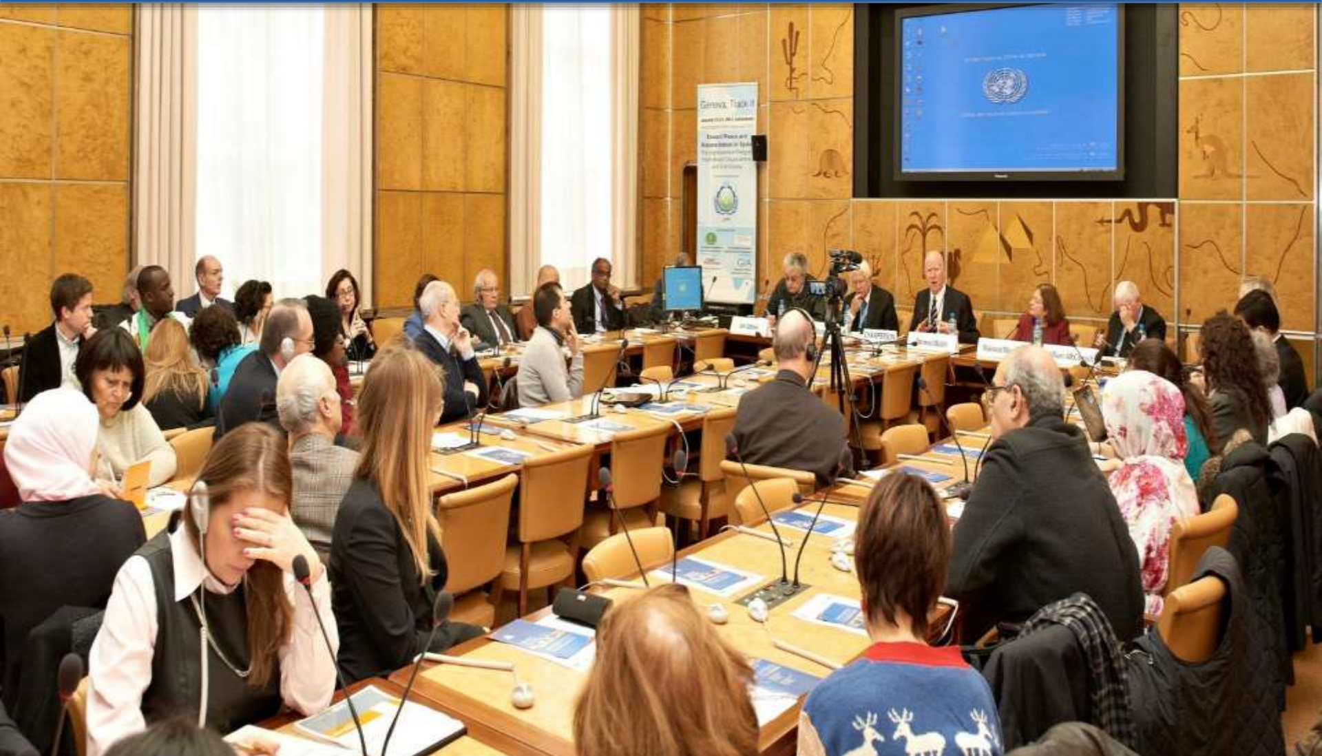
Conference on Syria at the UN in Geneva