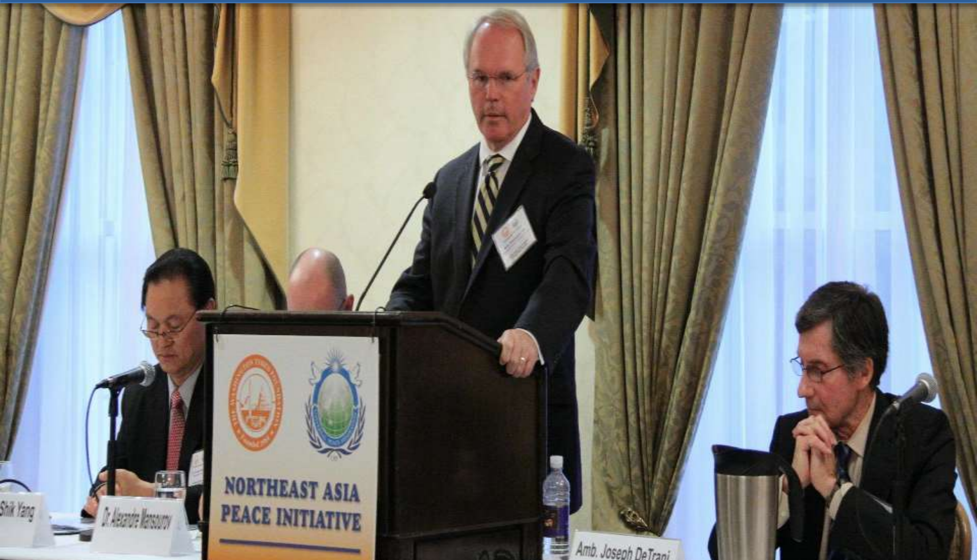
Christopher R. Hill, US Ambassador to Iraq (2009–2010)