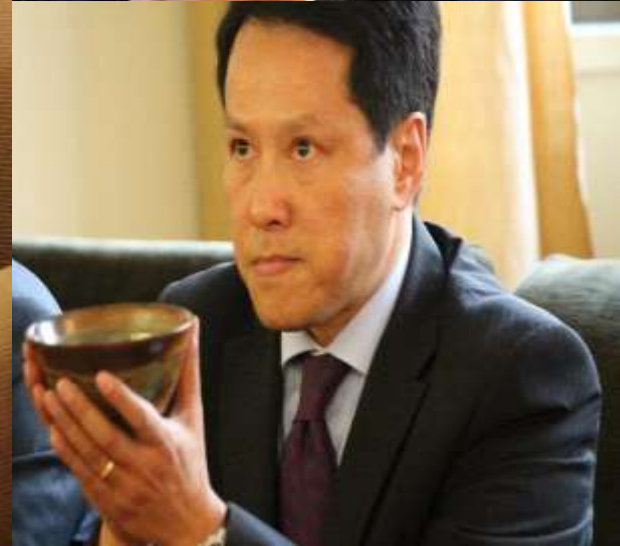
Tea Ceremony in New York City