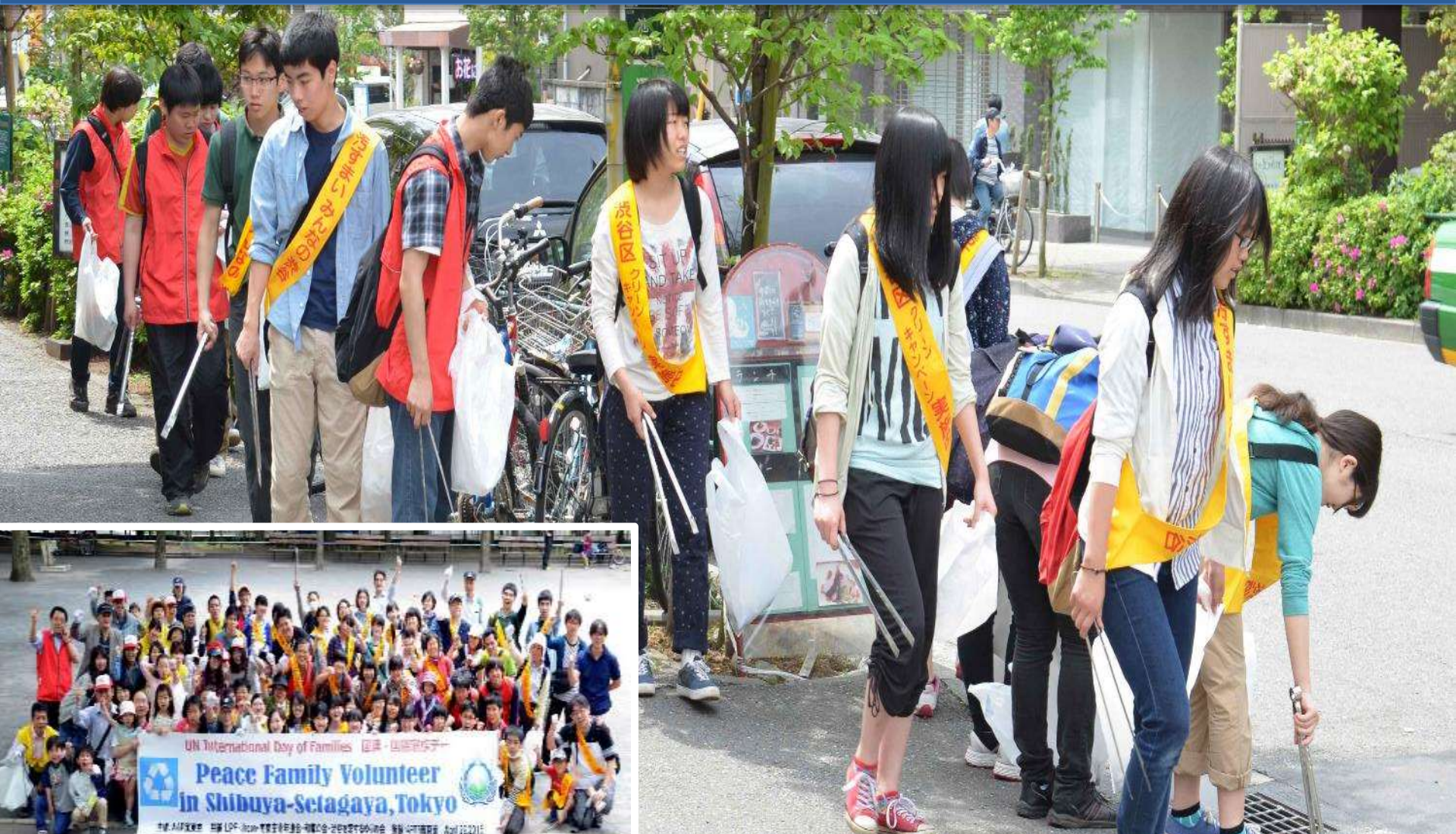
Cleanup along Route 246 – Tokyo, Japan