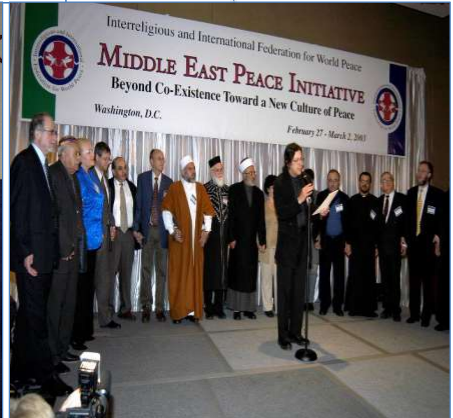
Middle East Peace Initiative (MEPI) Conference Washington DC, February 2003