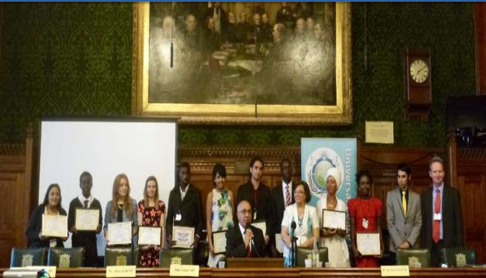
Annual Youth Achievement Awards in the UK House of Lords